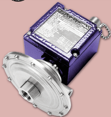
Weather Proof (NEMA 4 and 13)