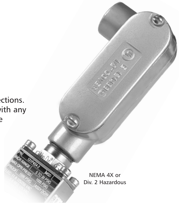
NEMA 4X or Div. 2 Hazardous

Weather Proof Junction Box with terminal strip electrical connections. Suitable for Div 2 hazardous areas when used in conjunction with any Enclosure 6 electrical used on Neo-Dyn Pressure or Temperature Switches.