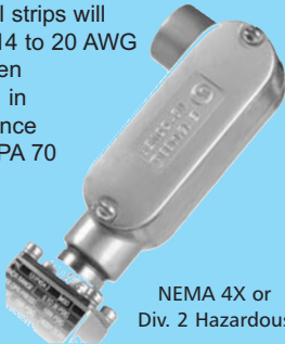
NEMA 4X or Div. 2 Hazardous

Terminal strips will accept 14 to 20 AWG wire when installed in accordance with NFPA 70