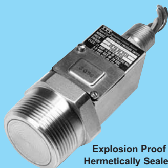
Explosion Proof Hermetically Sealed (NEMA 4X, 7, 9 and 13)